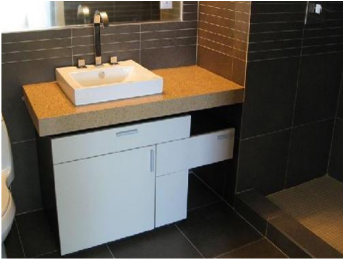
Modern style bathroom with big mirror