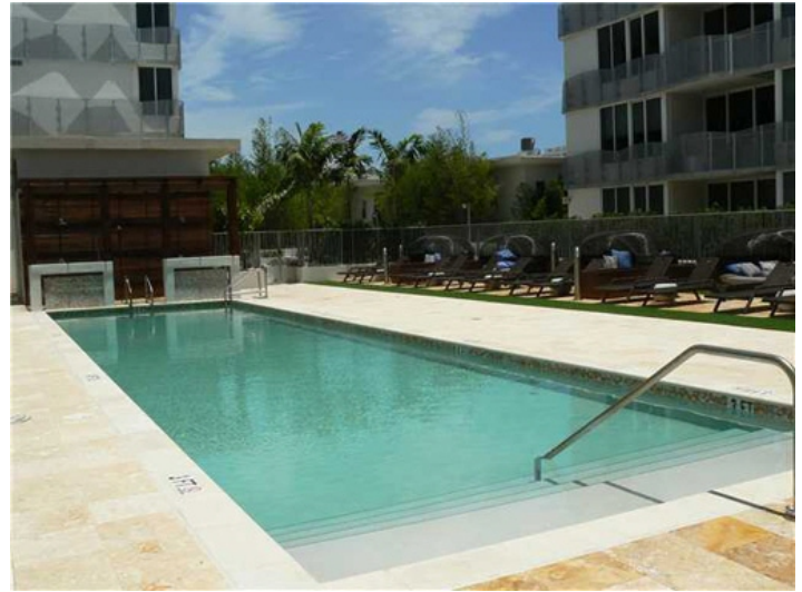
Common swimming pool with comfortable chaise longue