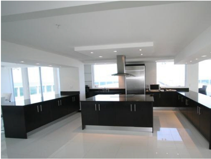
Modern and elegant kitchen