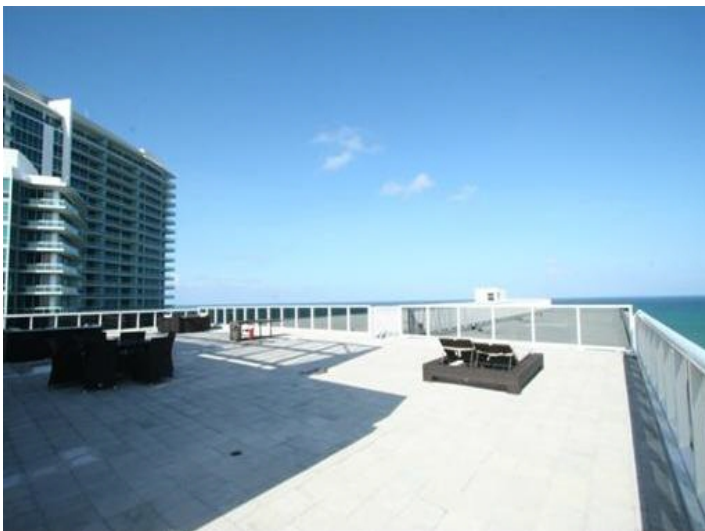
Fabulous terrace with gigantic views

All information is correct to the best of our knowledge. Errors and prior sale excepted. This prospectus is purely for information purposes. Only the notarized deed of sale is legally binding.