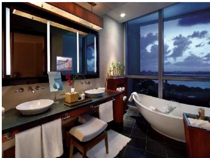
First-class bathroom with view to the Ocean