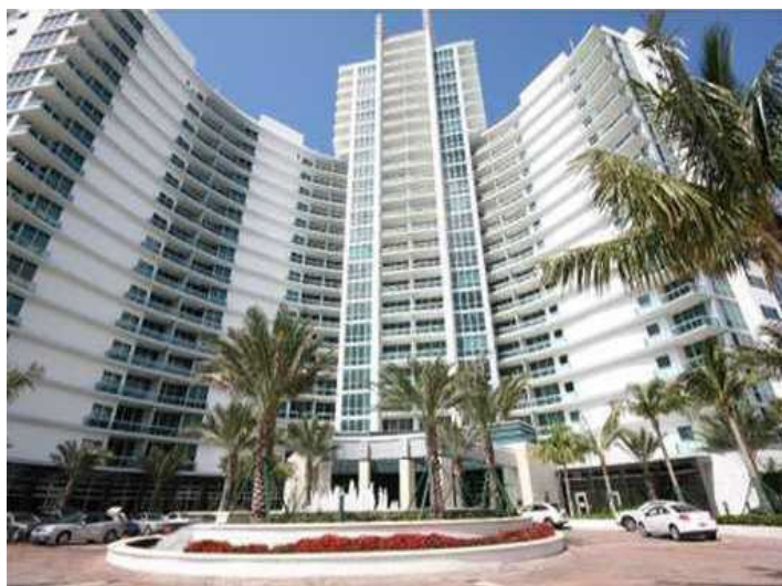
Impression of the skyscraper

All information is correct to the best of our knowledge. Errors and prior sale excepted. This prospectus is purely for information purposes. Only the notarized deed of sale is legally binding.