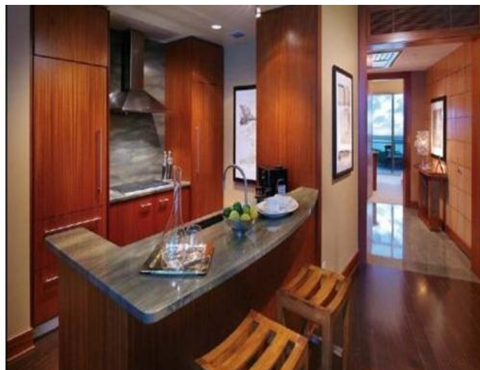
Equipped, nice kitchen