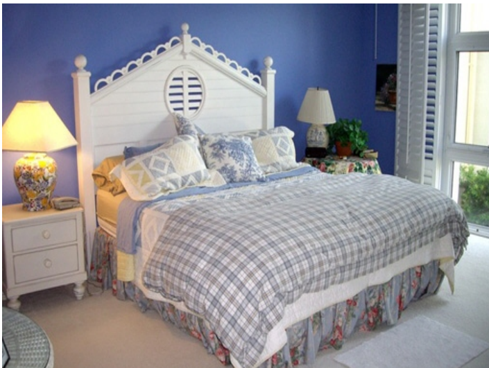
Master bedroom with king-size bed