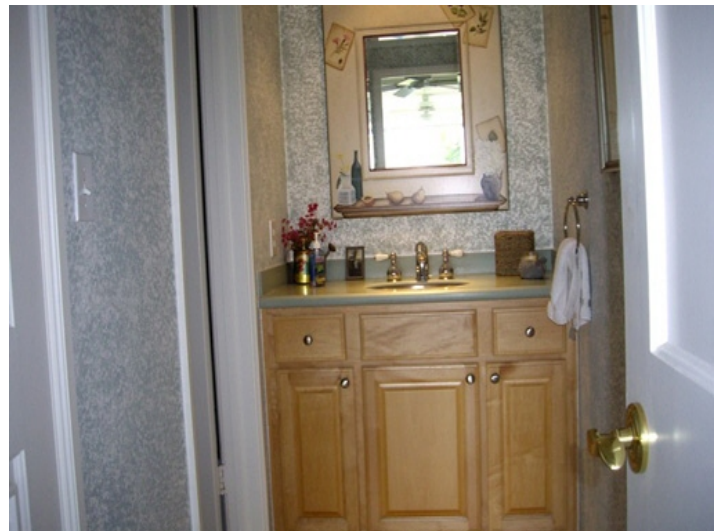
Access to the Master bathroom