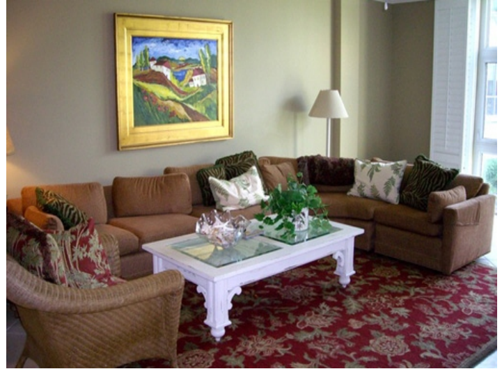
Huge and bright rest area