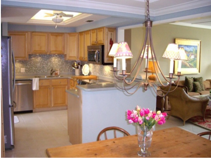
Huge kitchen view