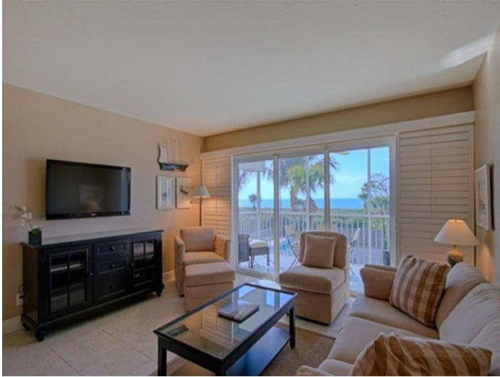
Living room with sofa and TV