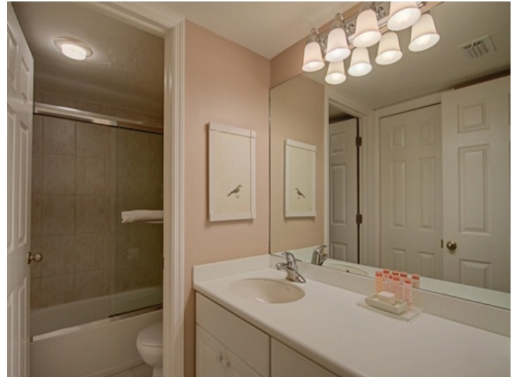
Bathroom with extra room