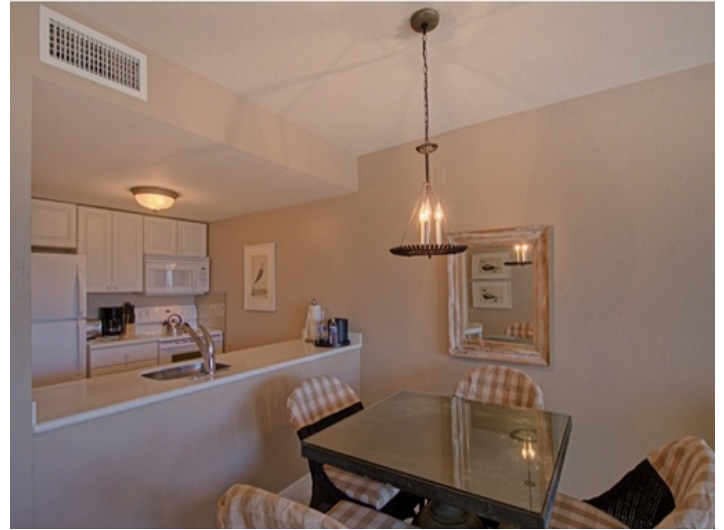
Kitchen with breakfast bar and dining table