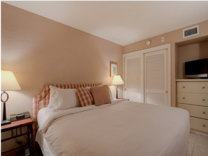
Bedroom with large bed