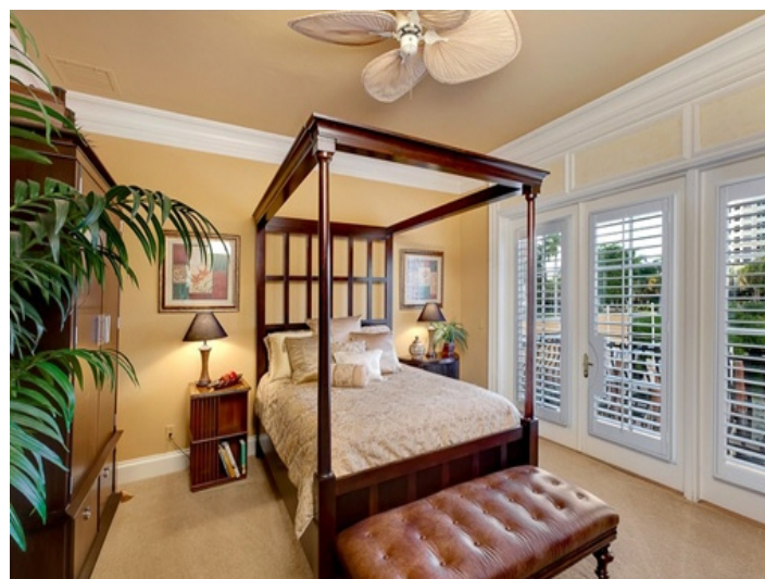
One of the other bedrooms