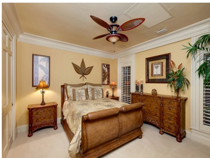
Master bedroom with its own bathroom