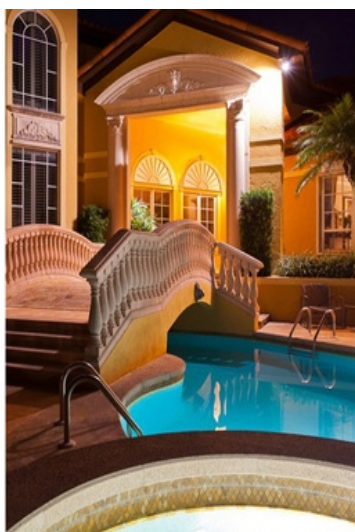
Property view during the night