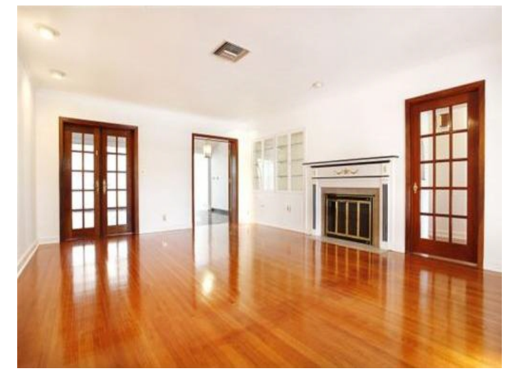
Bright, rambing rooms