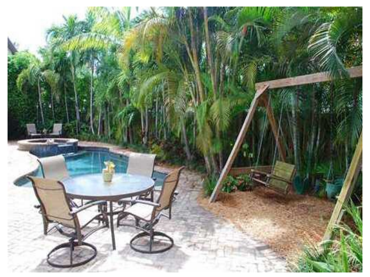
Pool and terrace