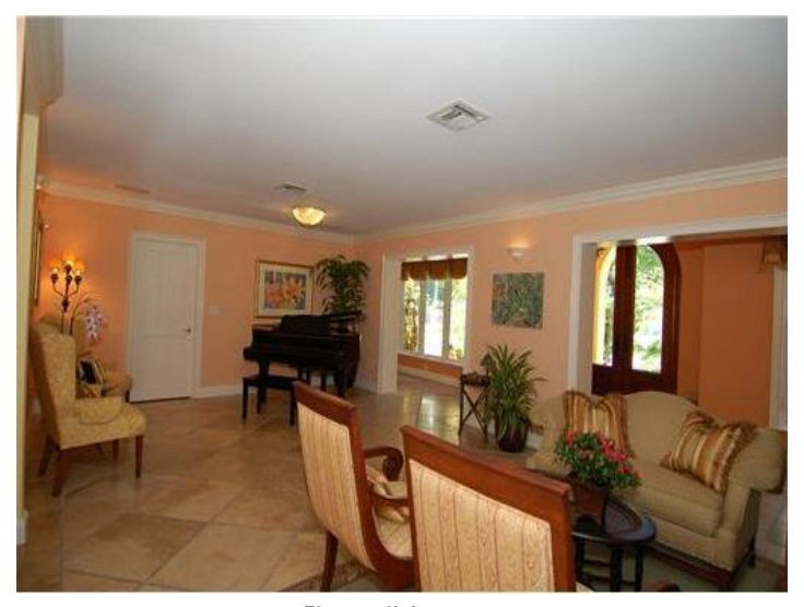
Elegant living room