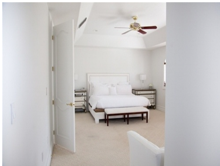
Master bedroom with walk-in closet