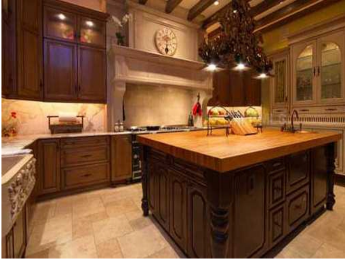
Rustic kitchen with island