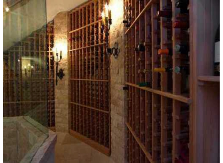
Exclusive wine cellar