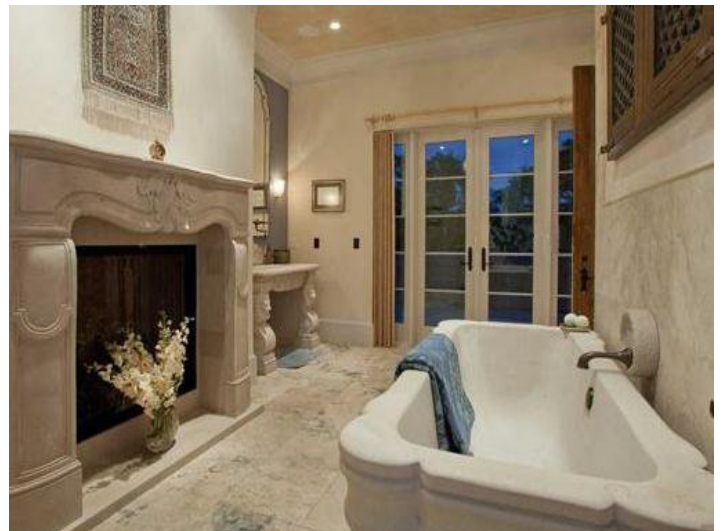
Luxury bathroom with fireplace

All information is correct to the best of our knowledge. Errors and prior sale excepted. This prospectus is purely for information purposes. Only the notarized deed of sale is legally binding.