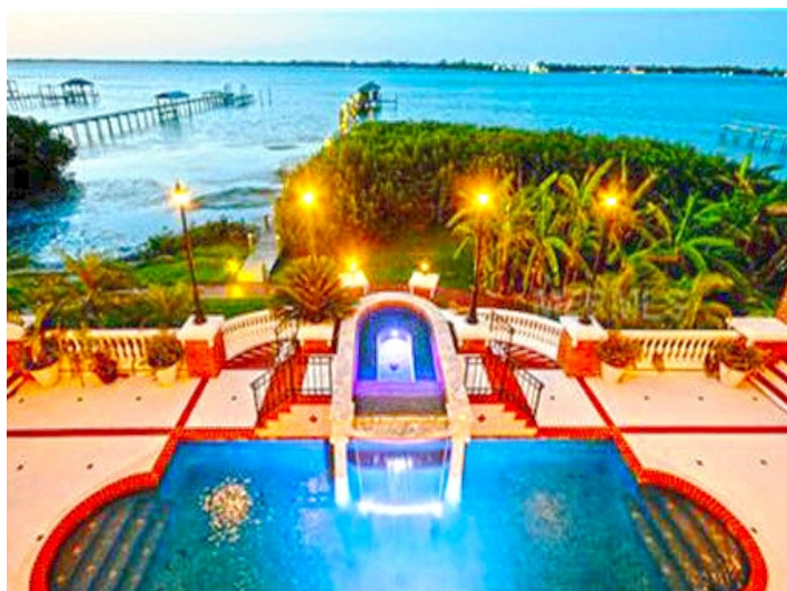
Luxurious private swimming pool