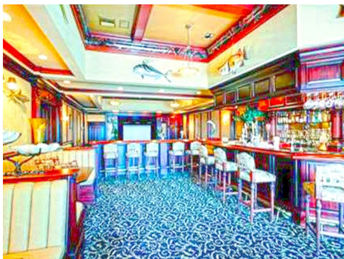
Private bar area