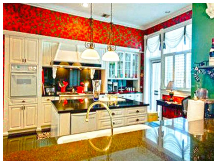
Fully equipped spacious kitchen