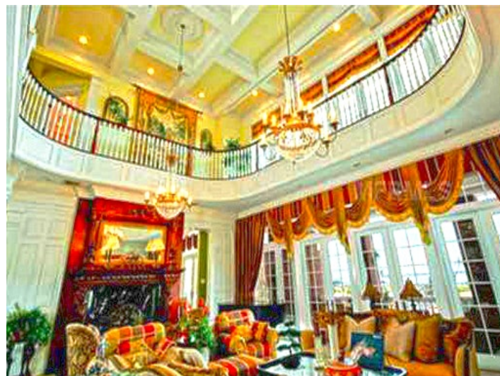
Two storey internal entertainment area with balcony